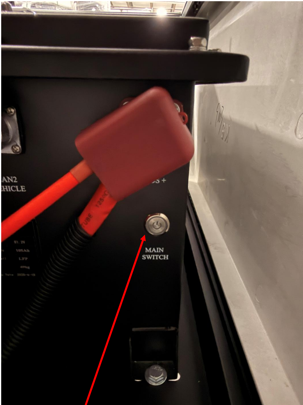
Battery ON/OFF Switch