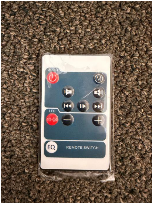
Sound Bar Remote