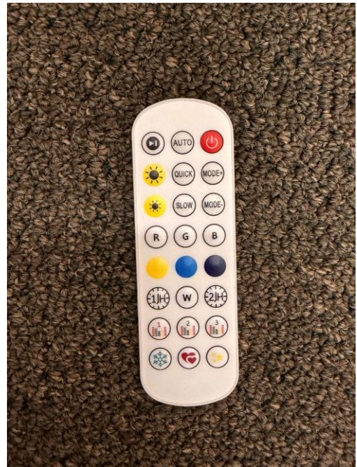
Remote for all LED lights except front grille lights