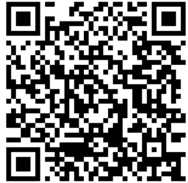
Happy Lighting for iOS